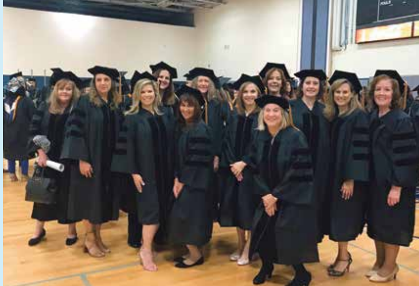
The first Hackensack Meridian Health Doctor of Nursing Practice cohort from Monmouth University celebrated their graduation at a ceremony in May 2019.