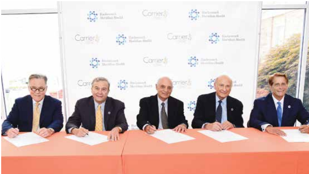
In early 2019, Hackensack Meridian Health completed its merger with Carrier Clinic. Officials commemorated the occasion at an event held at Carrier Clinic's Belle Meade campus.